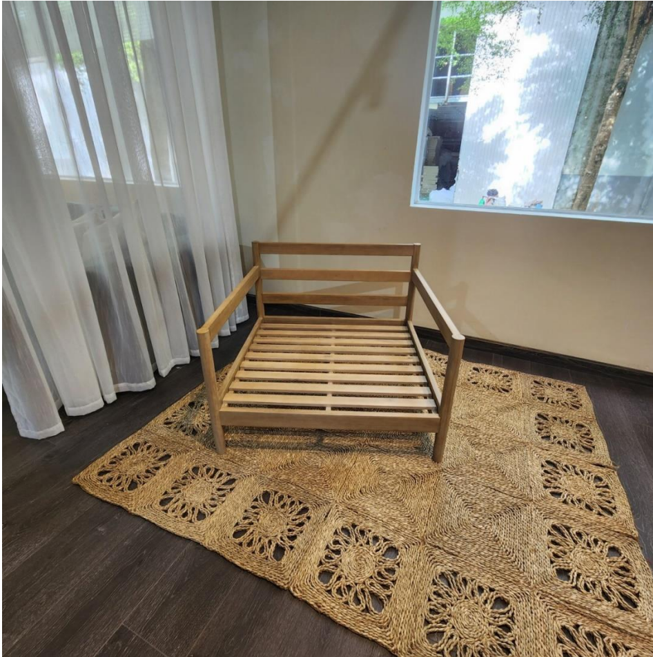
Hargrove Lounge Chair - Acacia